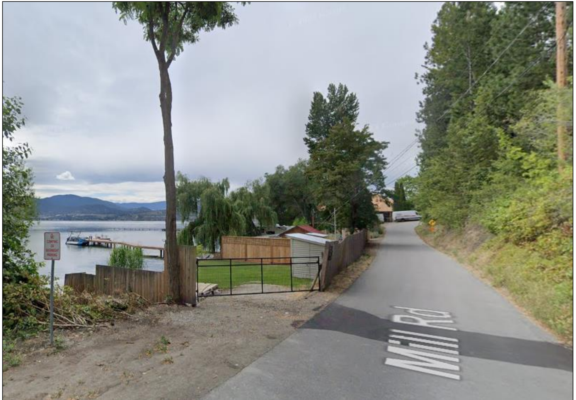
Attachment No. 1 – Site Photo (Google Streetview – July 2023)