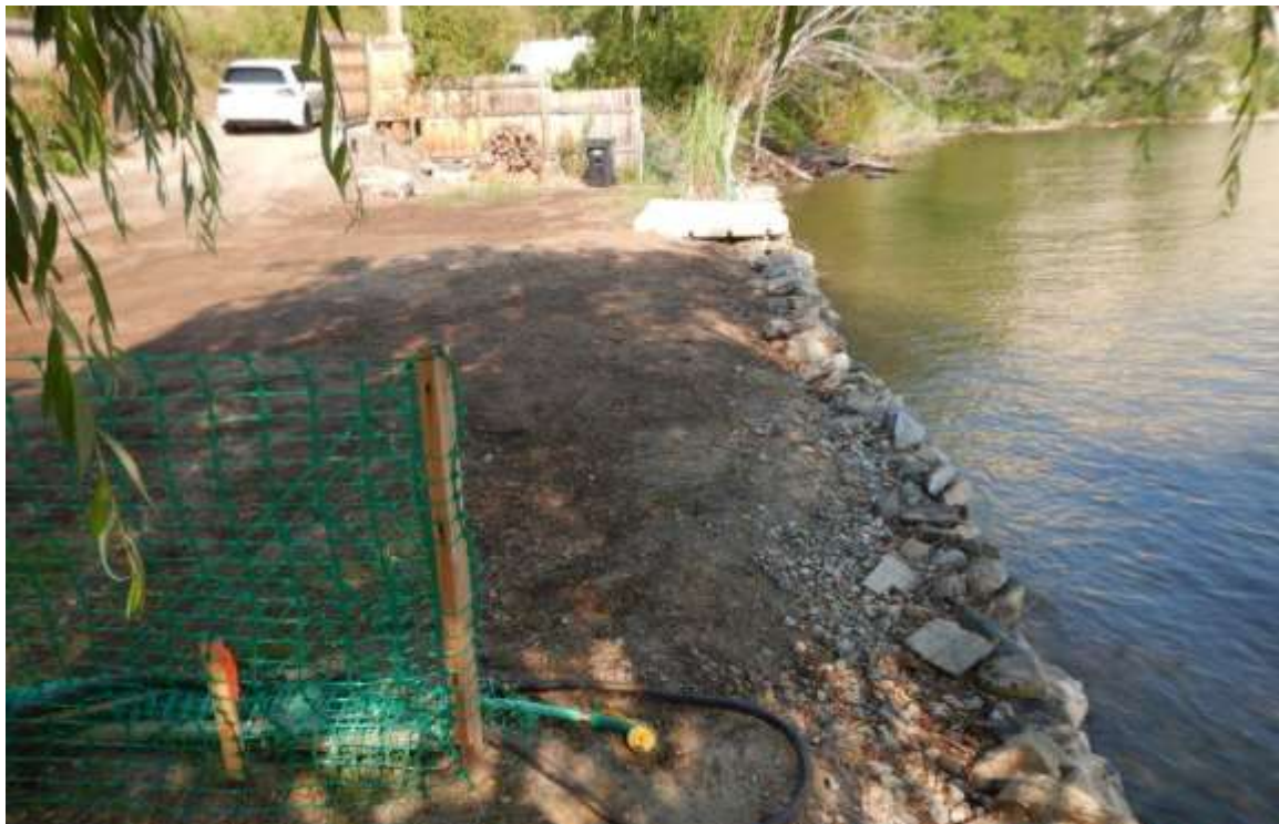
August 7, 2022 – View looking east and downstream along the stream boundary of Okanagan Lake adjacent to the subject property. Much of the riparian assessment area of adjacent properties contain a manicured amenity area. Much of the property has been historically used as a recreational property where the SPEA contains beach areas, manicured grass and gravel parking and picnic areas. Some native trees such as pines and cottonwoods are visible on adjacent properties however, understory species such as shrubs and grasses have been removed historically removed including the subject property.