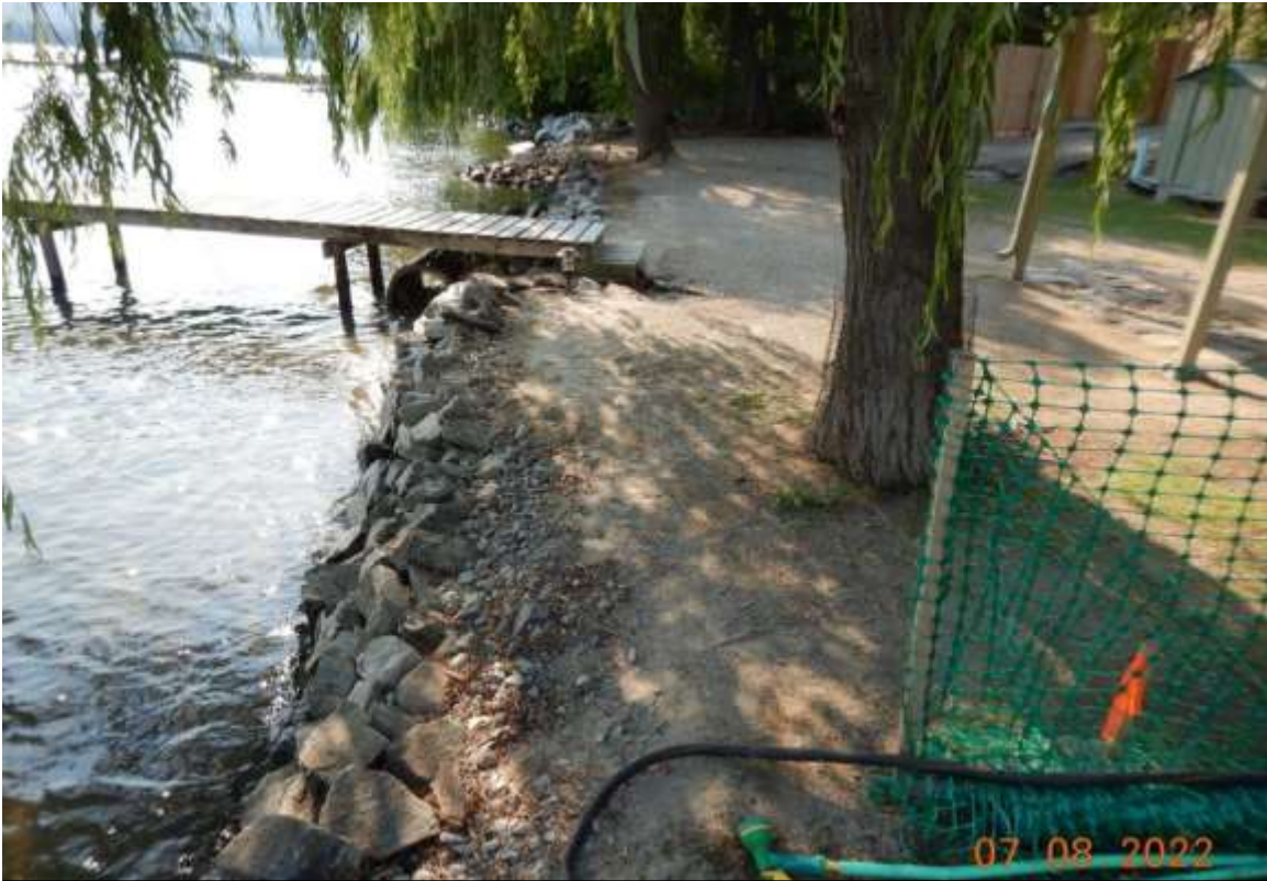
August 7, 2022 – View looking west and upstream along the stream boundary of Okanagan Lake adjacent to the subject property. Visible is the rock wall and manicured beach and lawn areas.