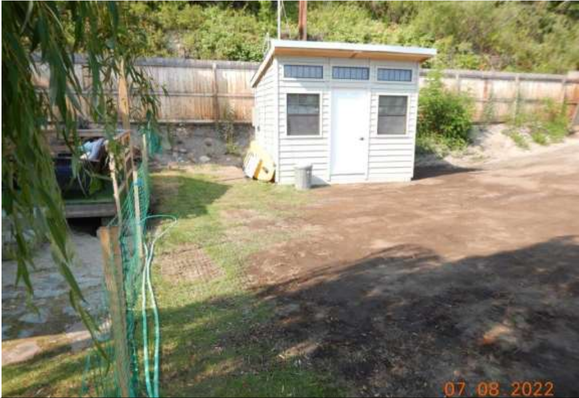
August 7, 2022 – View looking north at the existing cabin area, manicured lawn and gravel areas. Much of the property has been modified and >70% of the natural site potential vegetation has been removed. The property has been used as an amenity space and recreational property. As such the property is currently and historically a brownfield.