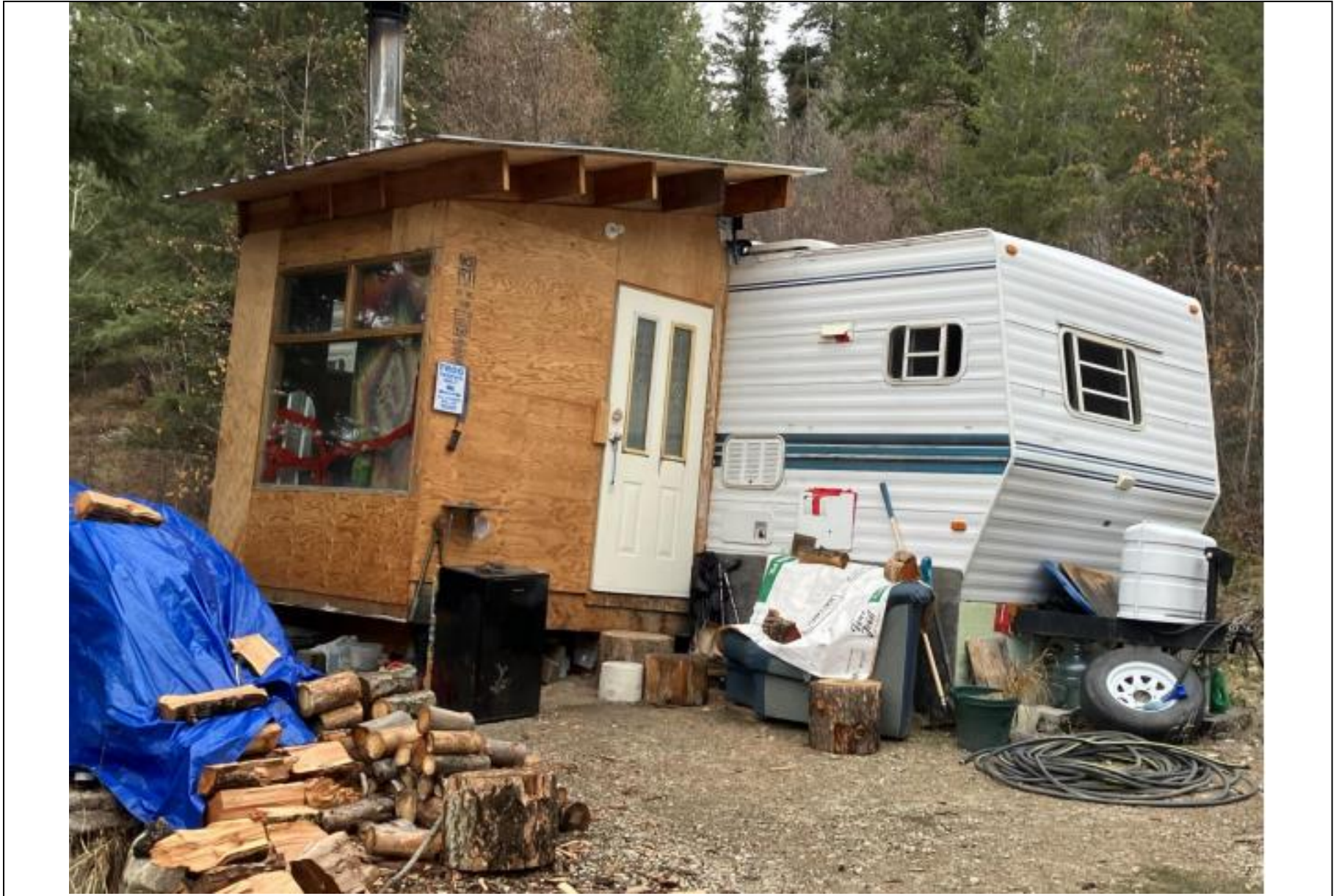
Attachment No. 2 – Site Photo (RV #1)