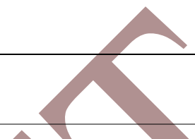
Illustration 2: Site Plan