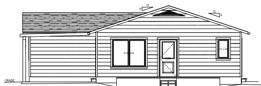
NORTH ELEVATION SCALE: 1/4" = 1'-0"