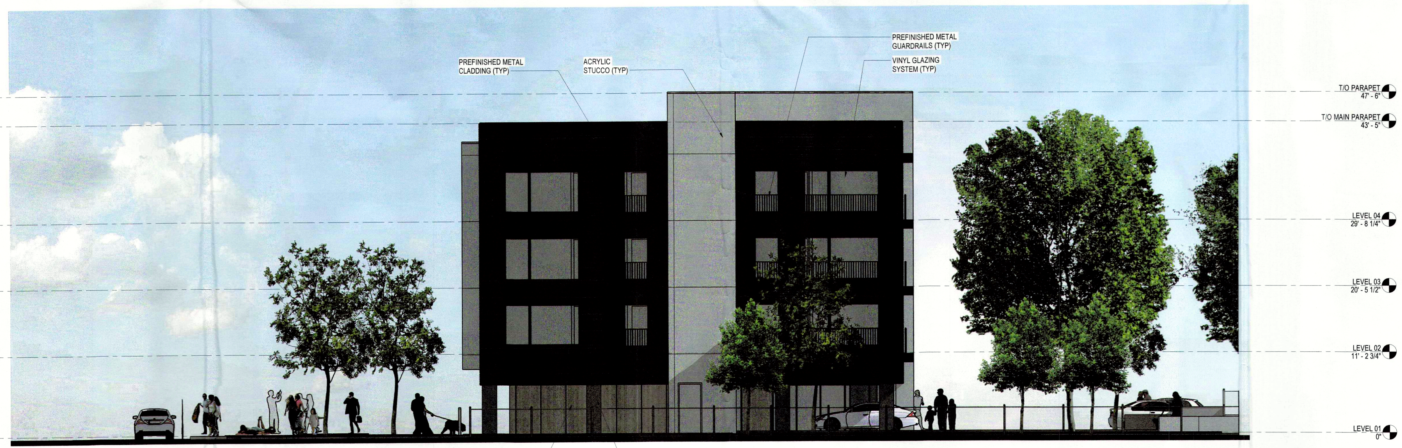
2 EAST ELEVATION 1/8" = 1'-0"

9/1/2020 1:40:09 PM C:\w\2019\OK Falls Phase 2\06\04_Proposal_RE-OK Falls_BChousing_Phase 2_CENTRAL_DS\AWYER.rvt