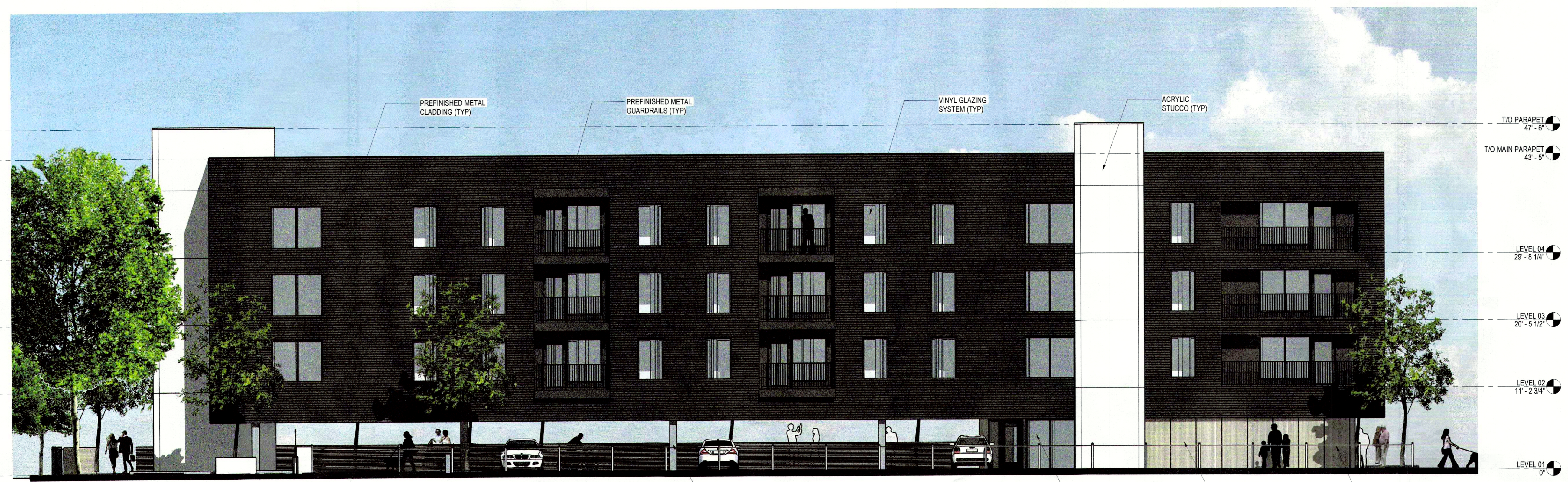
1 NORTH ELEVATION 1/8" = 1'-0"