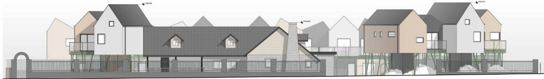
1 Street Elevation 1:10