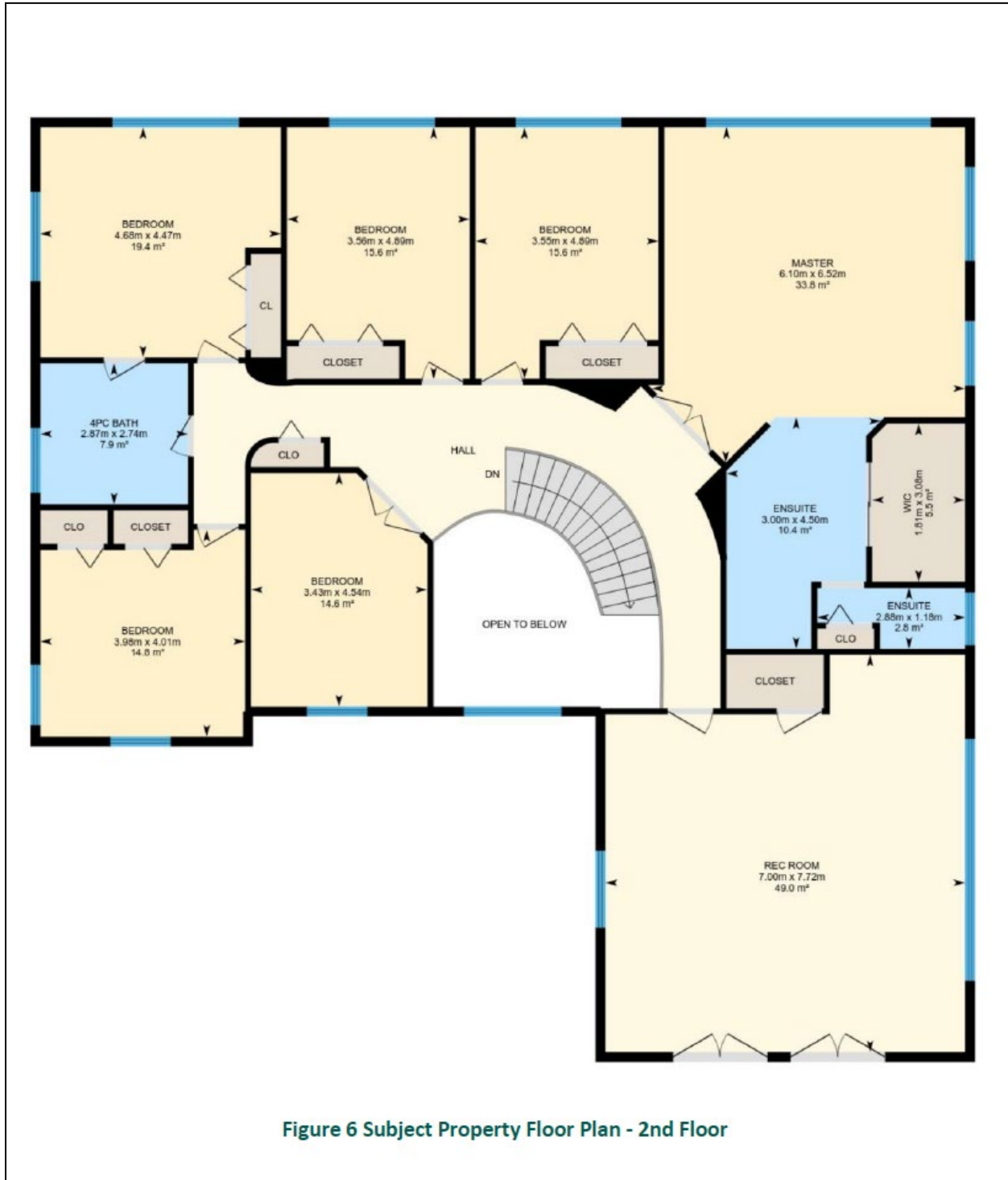
Figure 6 Subject Property Floor Plan - 2nd Floor