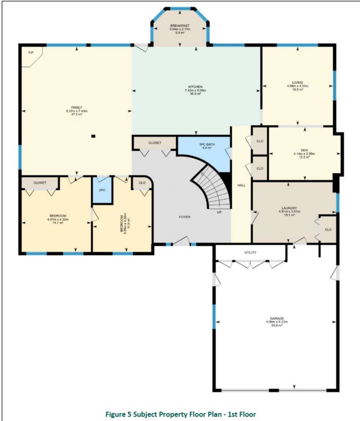
Figure 5 Subject Property Floor Plan - 1st Floor