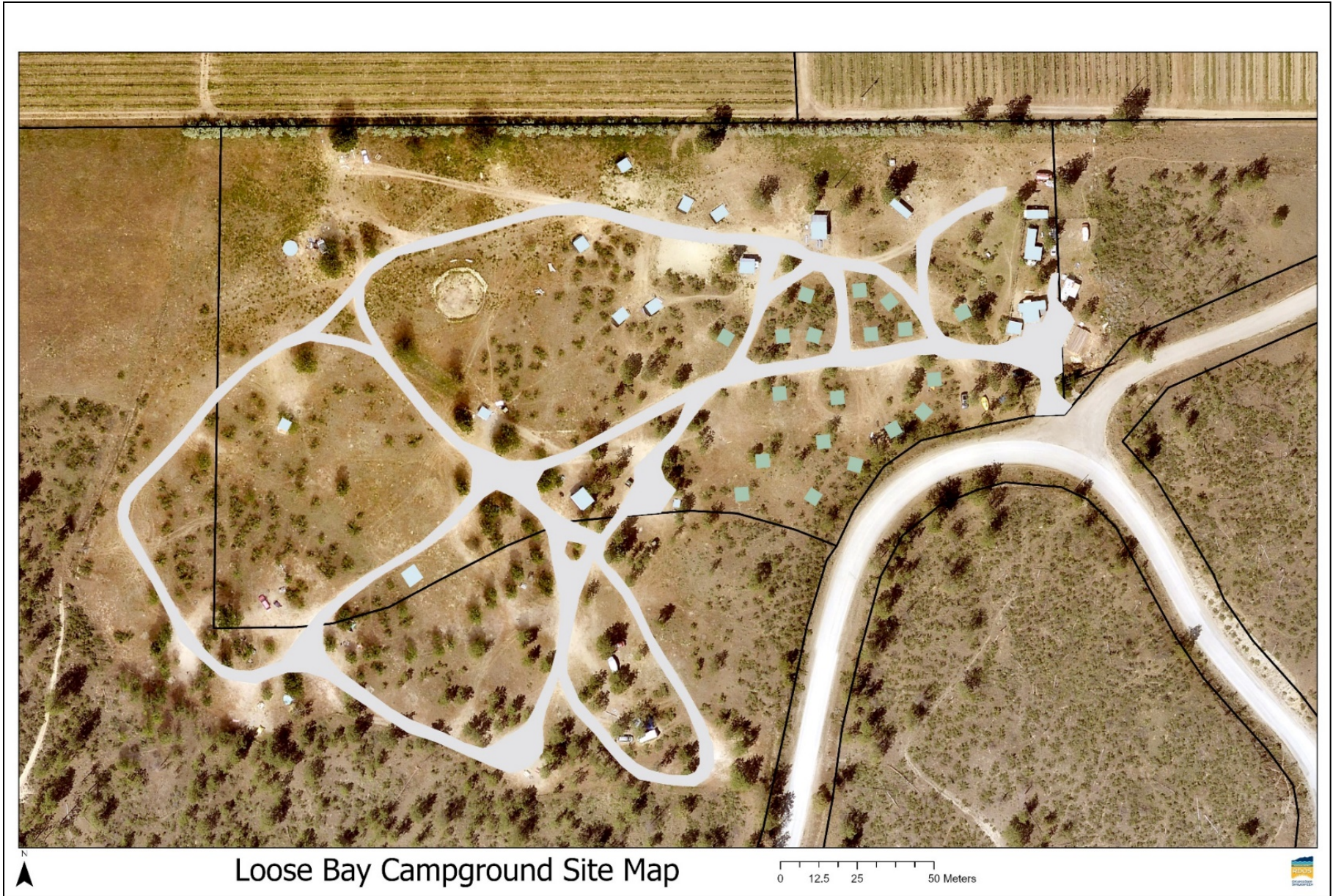
Loose Bay Campground Site Map