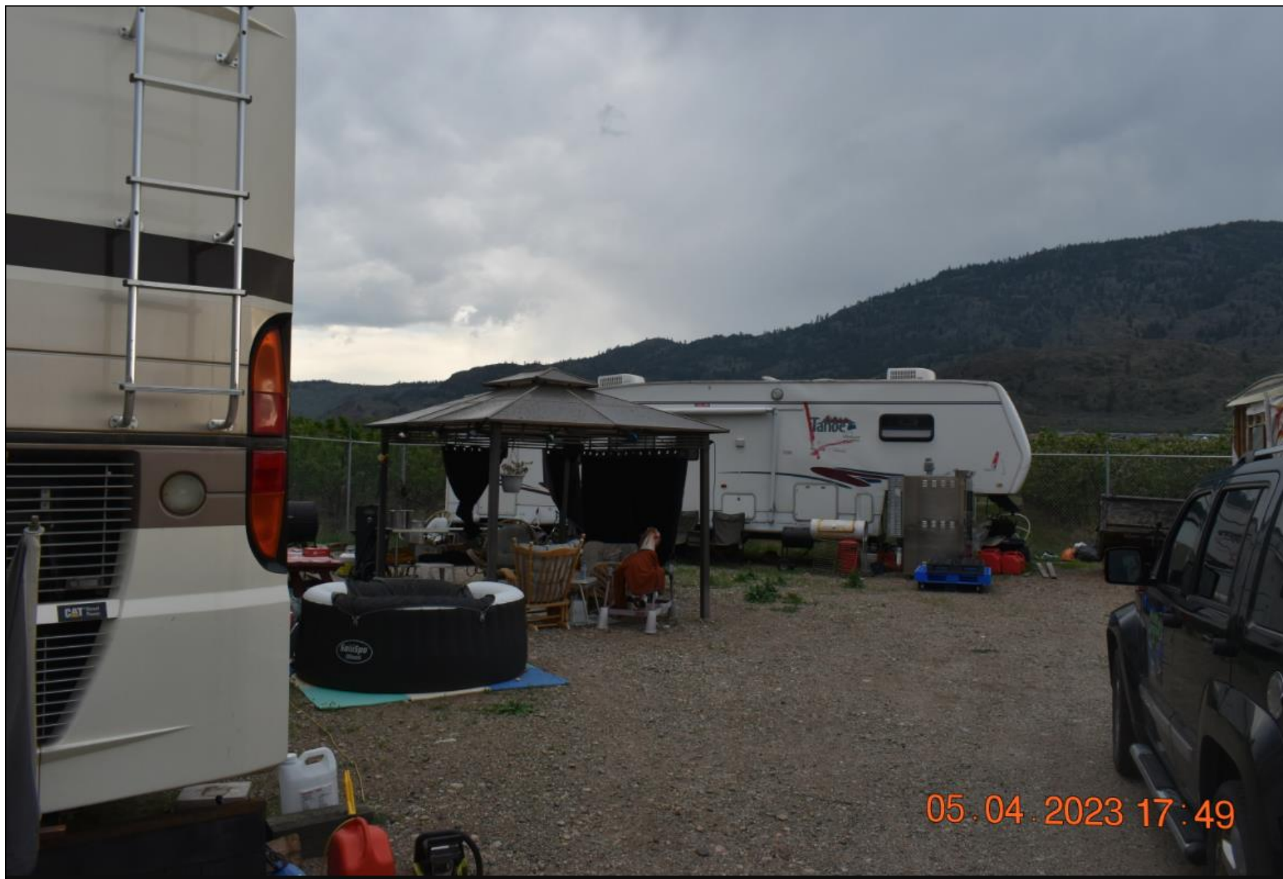
Attachment No. 6 – Site Photo 3 (2023)