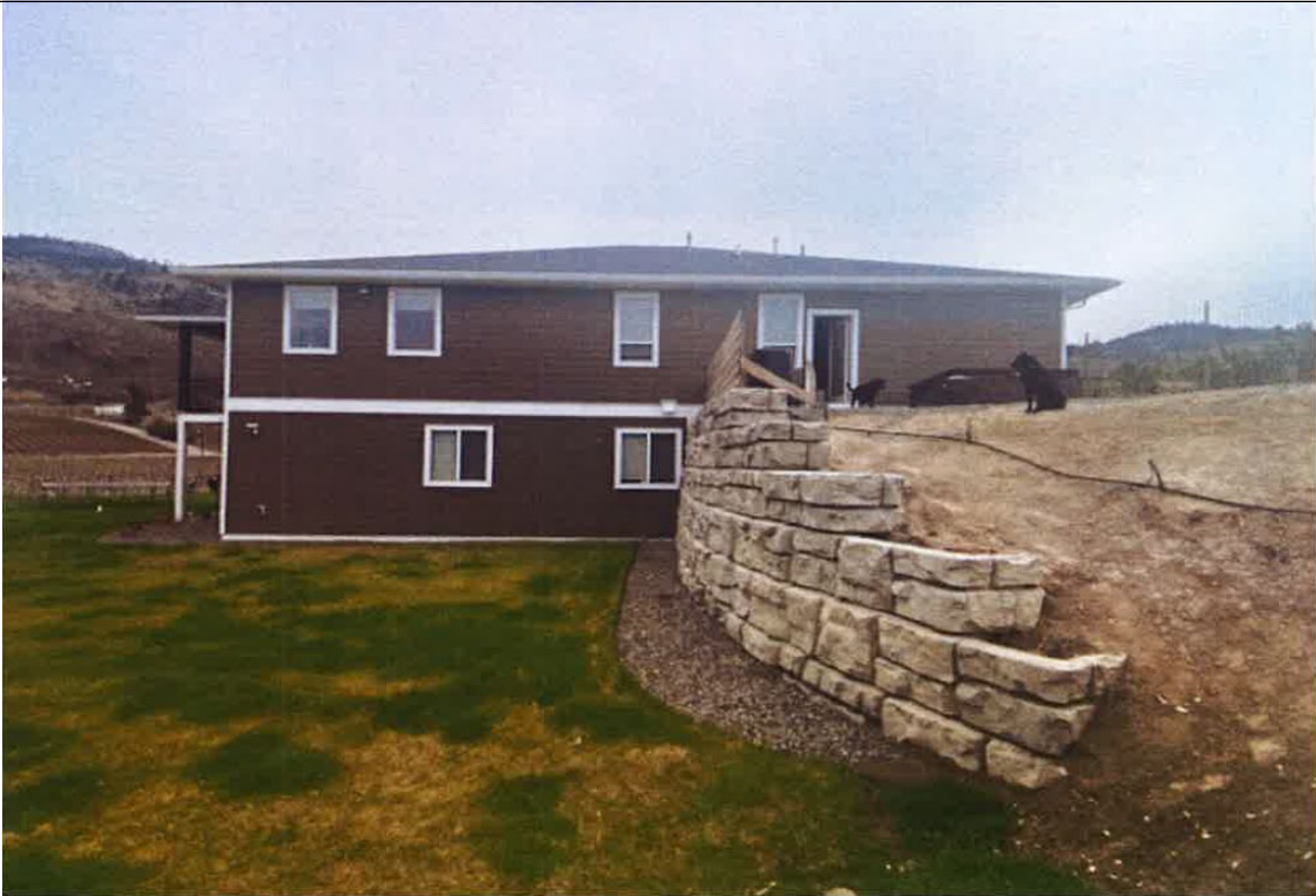
Attachment No. 1 – Site Photo (retaining wall looking east)