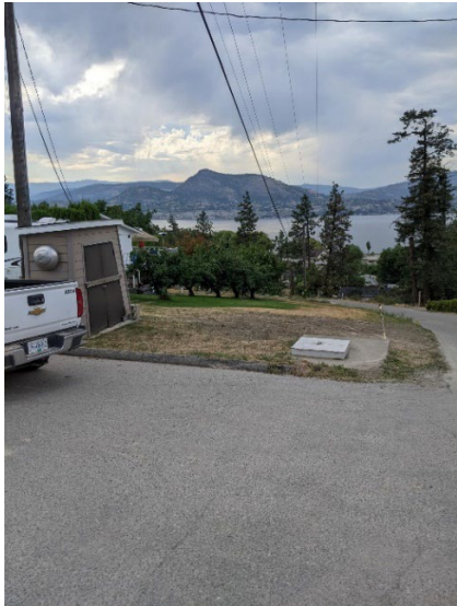
Figure 1. Existing Infrastructure Boothe Road