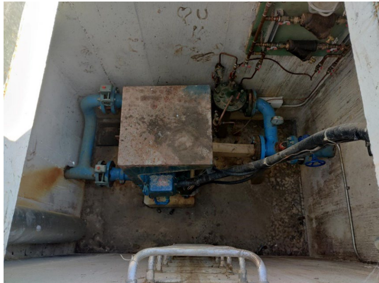
Figure 2. Existing Vault Boothe Road