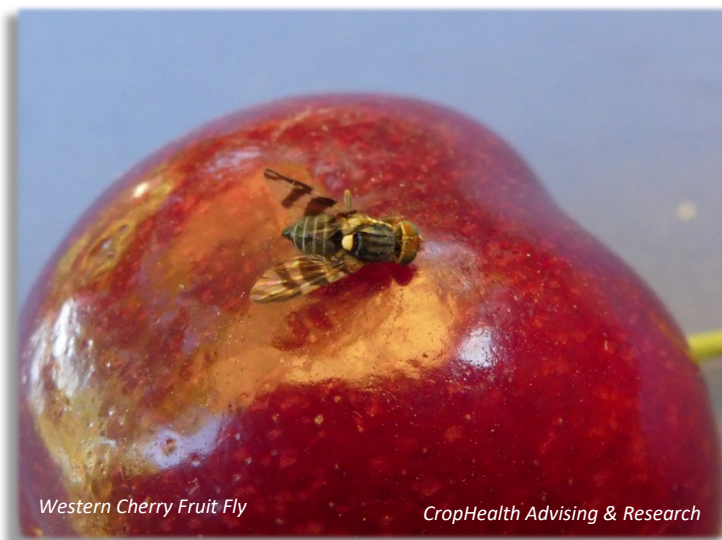
Western Cherry Fruit Fly

Harvesting: Remove ALL fruit at harvest (June-Aug) & make sure all diseased & insect-infested fruit is destroyed properly. Let red cherries ripen on the tree until dark in color. The ripening process is stopped once fruit is picked. For this reason, it is important to be diligent with picking to avoid fruit decomposition & pests.