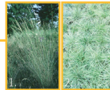
1. Bluebunch Wheatgrass 2. Idaho Fescue