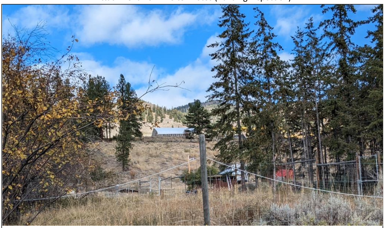
Subject Accessory Building, looking North (Photo taken October 16, 2023)