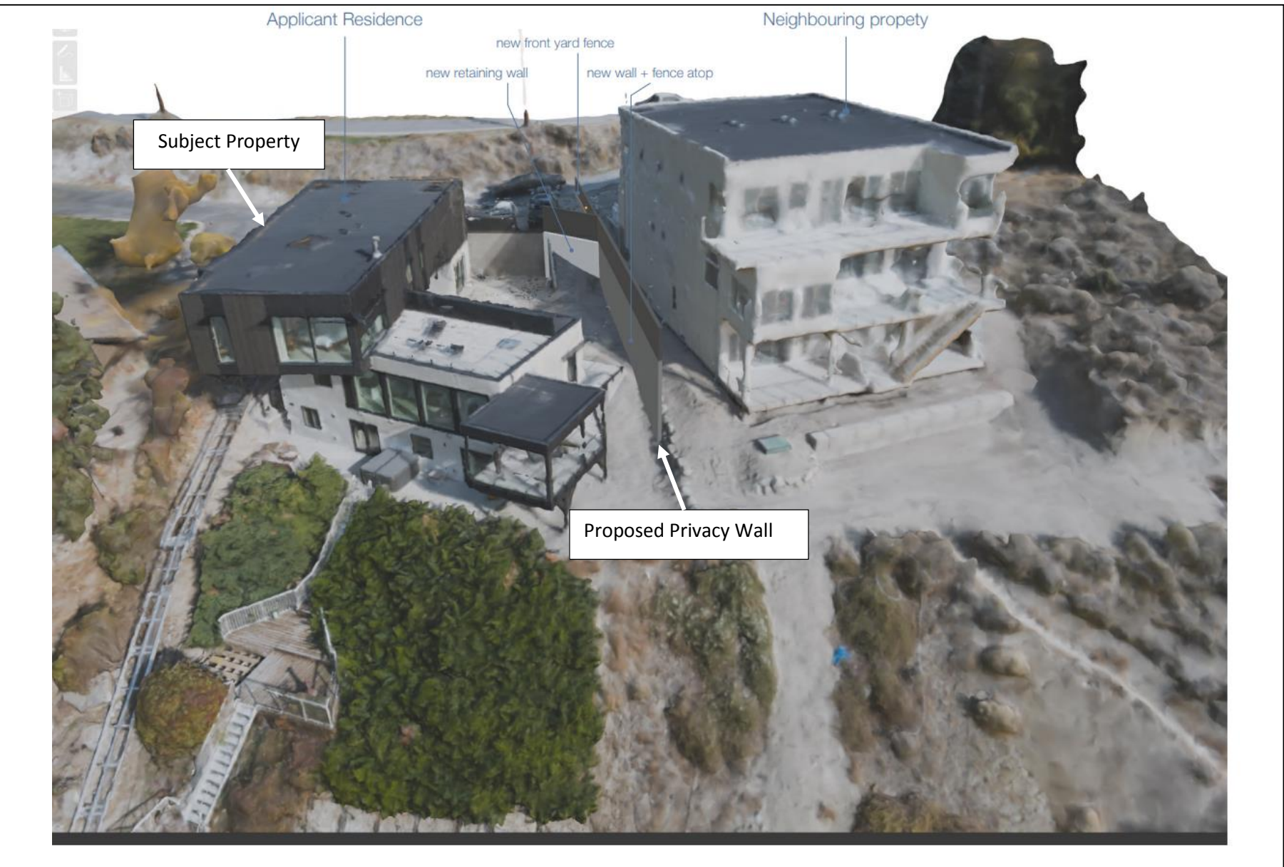
Attachment No. 4 – Applicant's Conceptual Drawing