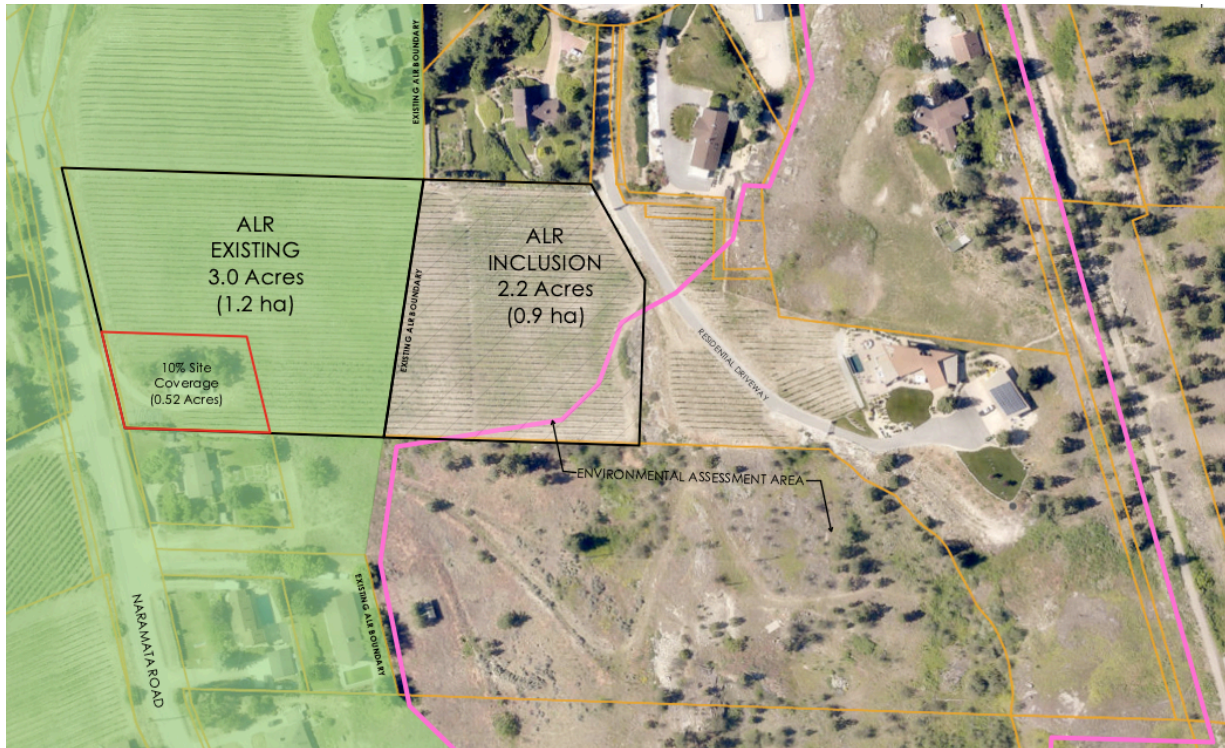
Aerial View Showing Proposed Lot A & B, & Proposed ALR Inclusion (above)