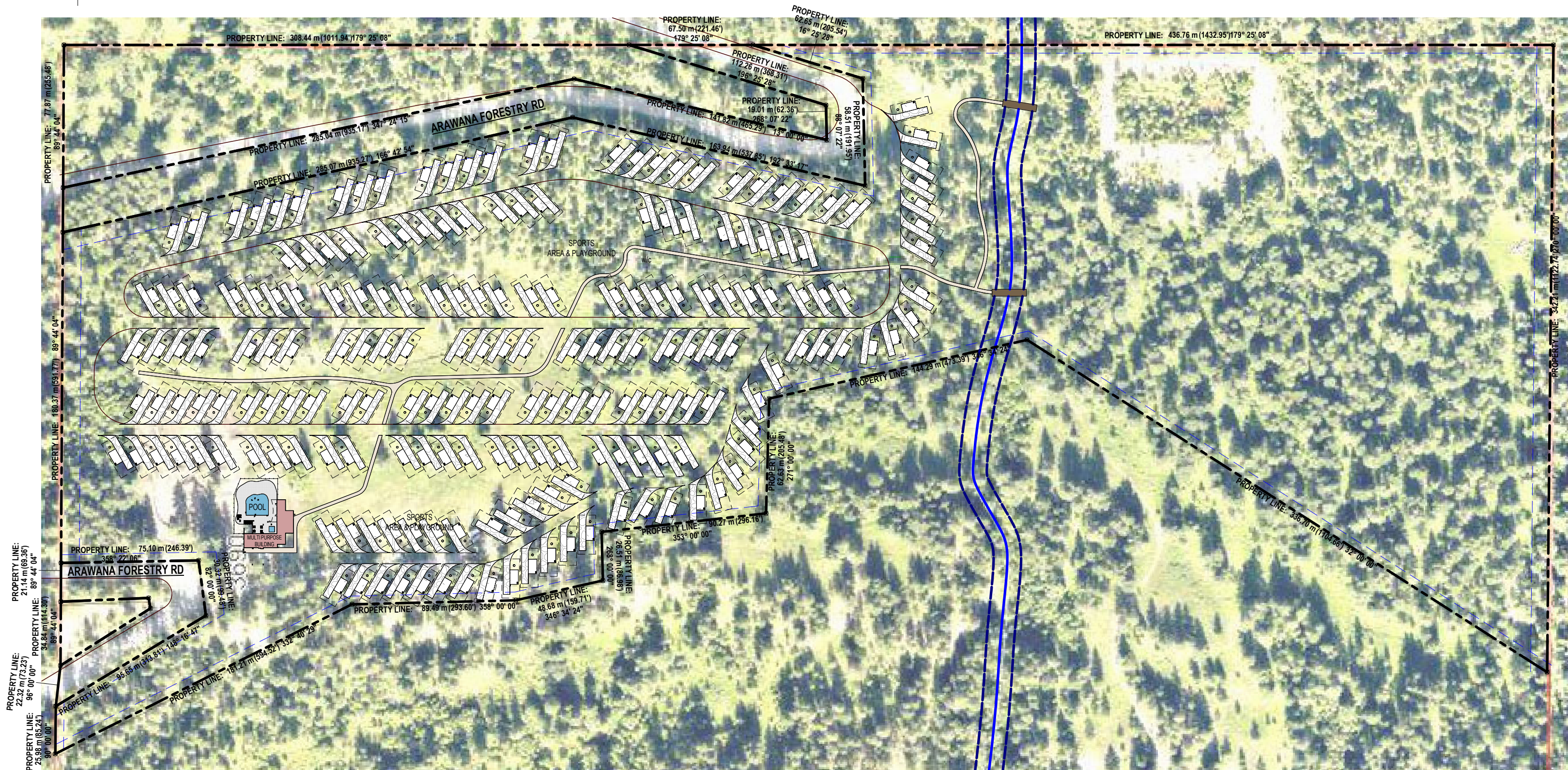
① SITE LAYOUT GOOGLE UNDERLAY 1 : 2000