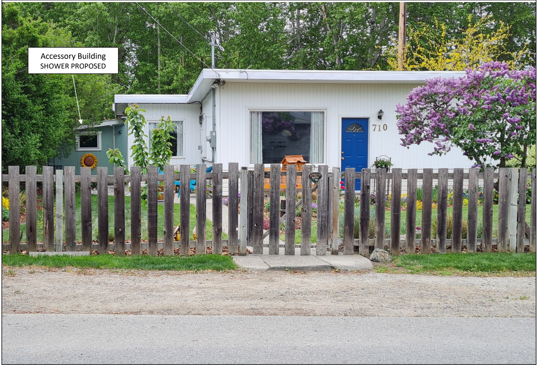
Attachment No. 1 – Site Photo (Front, 2021)