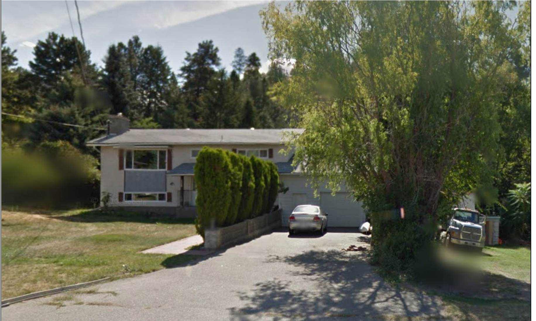
Attachment No. 1 – Site Photo