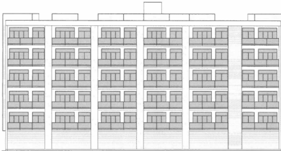
LAKESIDE NORTH ELEVATION