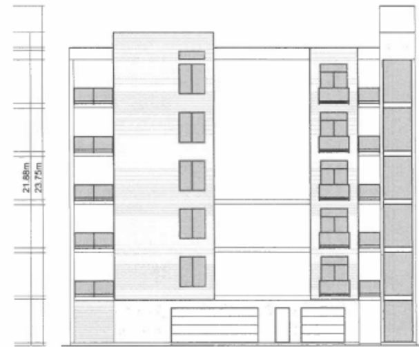
LAKESIDE WEST ELEVATION