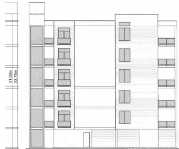
LAKESIDE EAST ELEVATION