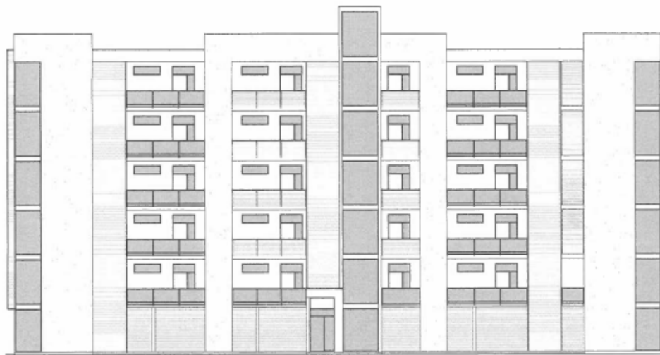
LAKESIDE SOUTH ELEVATION