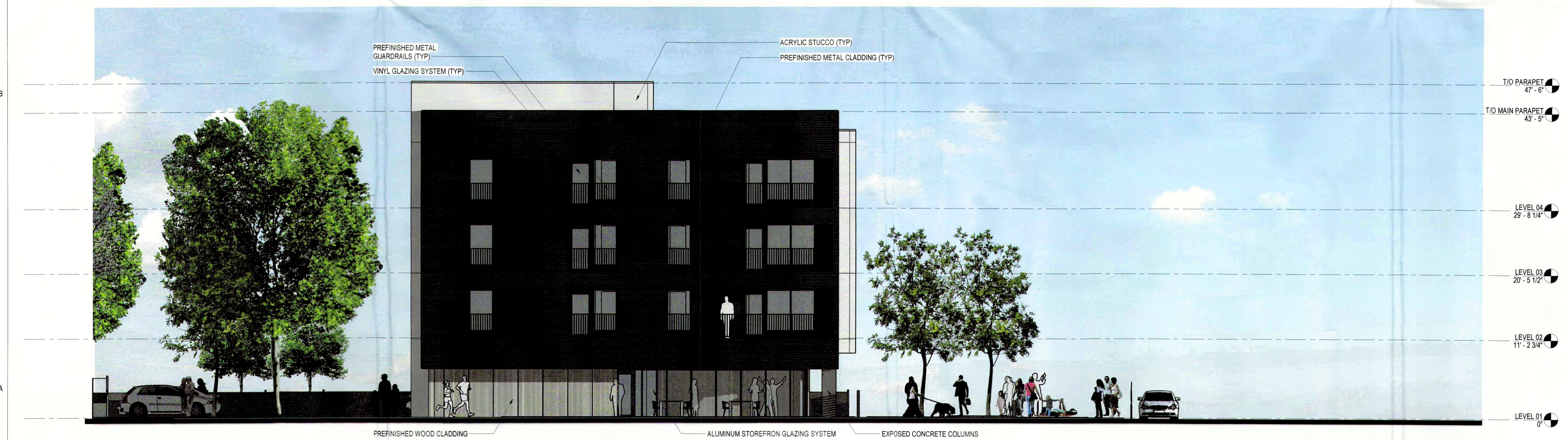
2 WEST ELEVATION 1/8" = 1'-0"

9/1/2020 14:00:07 PM C:\v\2019\OK Falls Phase 2\Job#_Project#_RE-OKFalls_BC Housing Phase 2_CENTRAL_DSAWYER.rvt