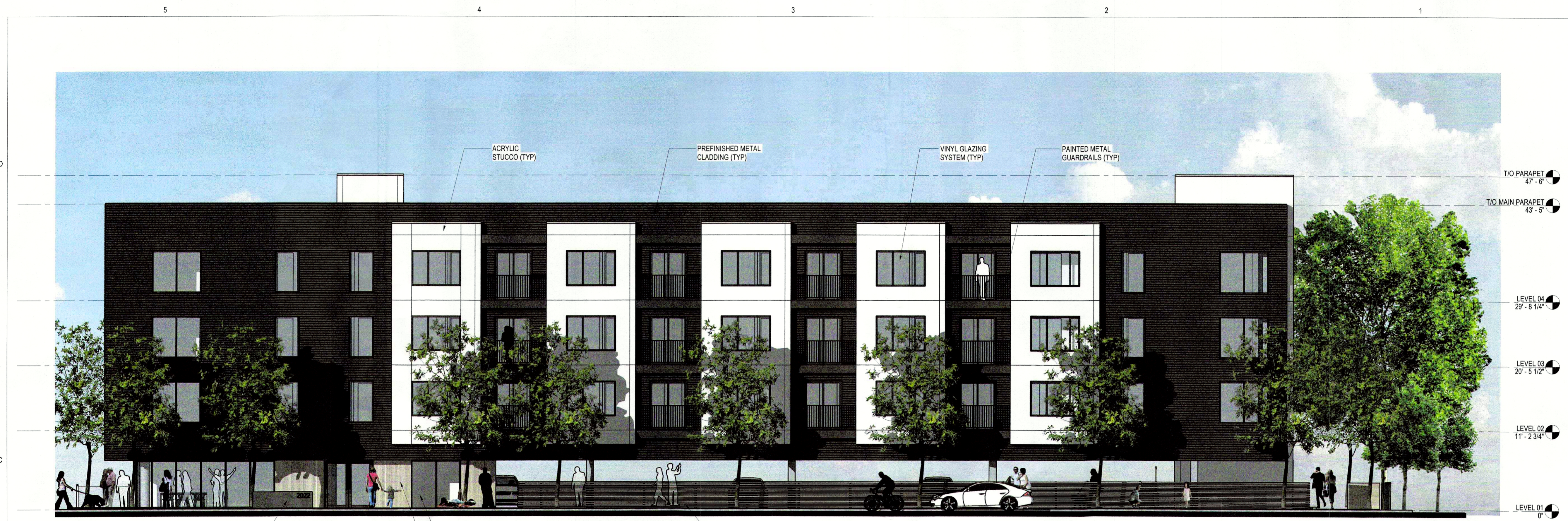
1 SOUTH ELEVATION 1/8" = 1'-0"