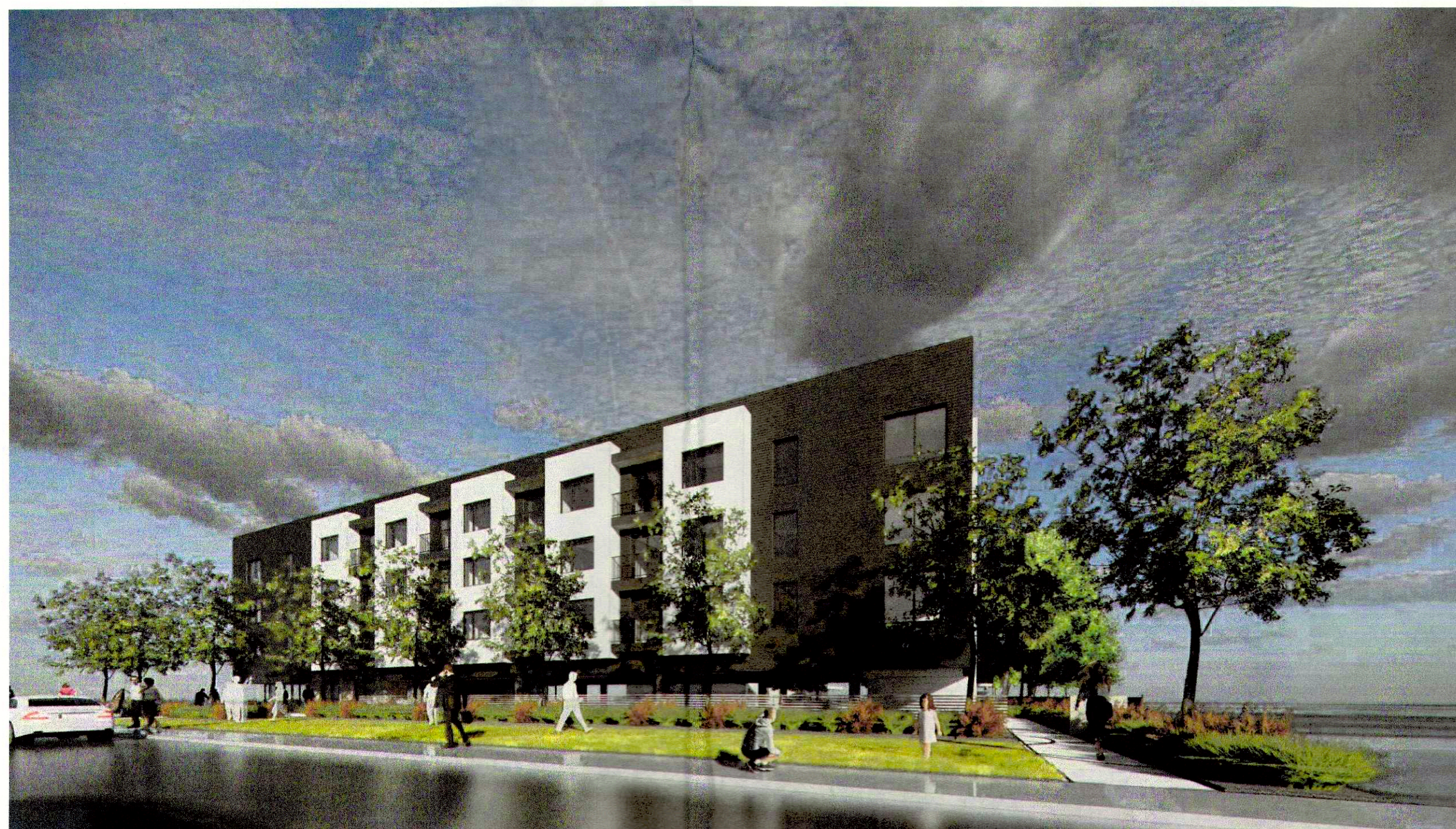
VIEW LOOKING NORTH WEST