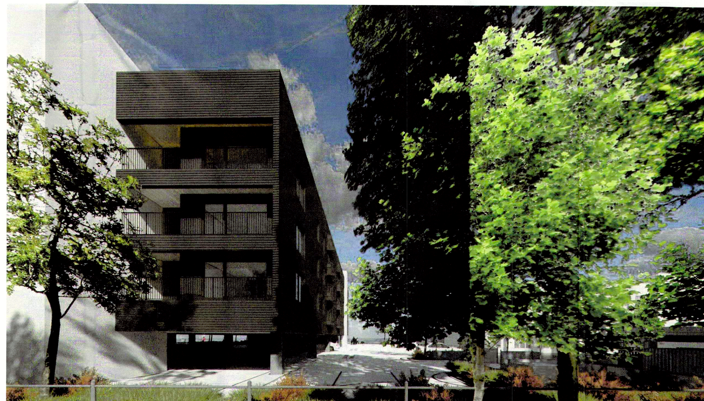
VIEW LOOKING SOUTH EAST