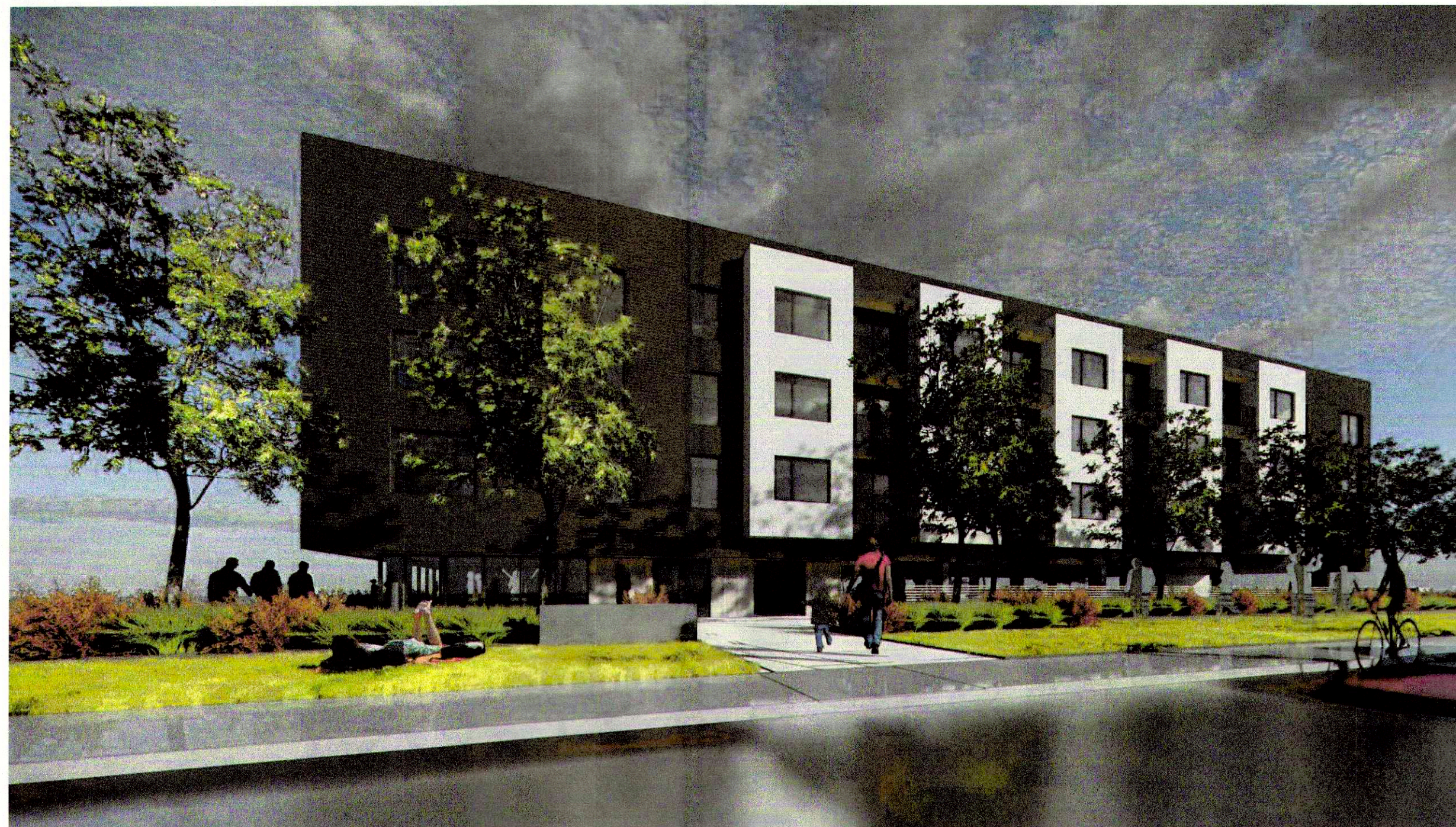
VIEW LOOKING NORTH EAST