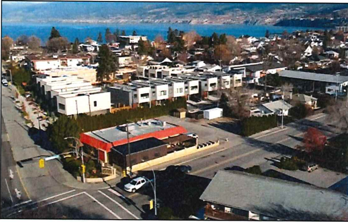
This five-lot block on Westminister Avenue in Penticton is listed for sale at $3.15 million. (Contributed)