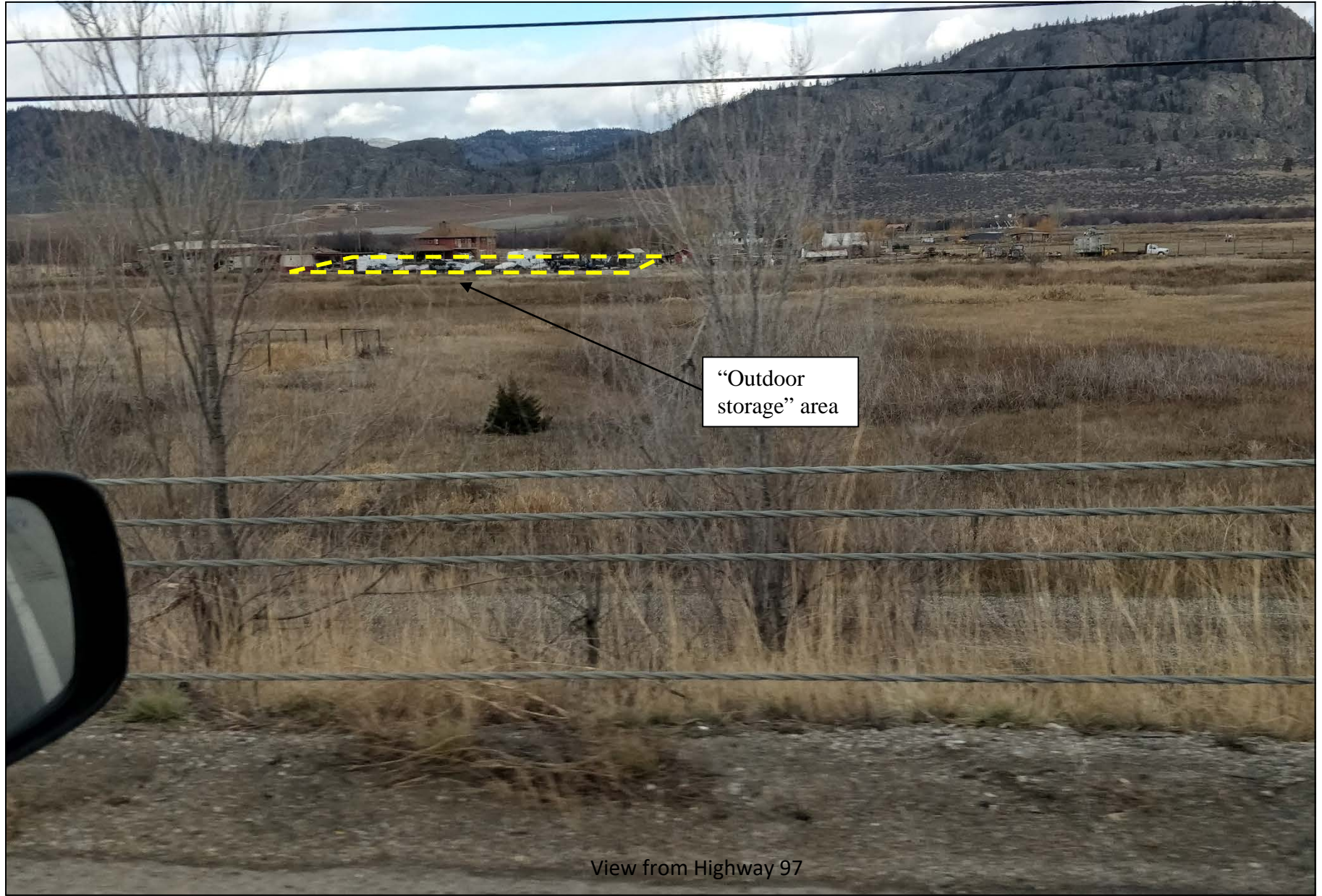
View from Highway 97