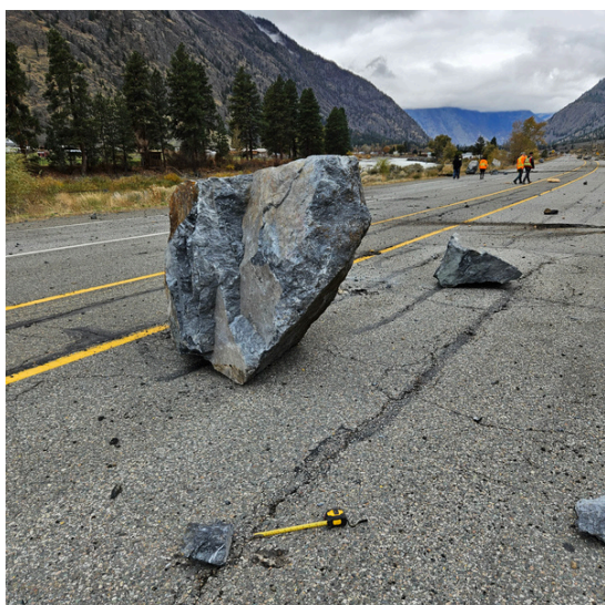
2023 rockslide west of Keremeos in Electoral Area "G"