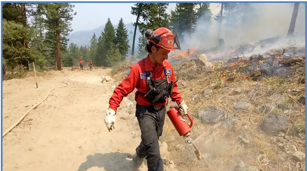
Crews regularly complete small hand ignition operations using drip torches. These ignition operations occur along control lines to extend the amount of non-combustible fuels ahead of the main fire, helping to further secure the control line.

One structural protection specialist, three structural protection units, one structure protection crew (five personnel), and twenty-one firefighters from five fire departments. Personnel are remaining on site through the night to provide structure protection continuity. Structural protection personnel will continue to assess and prioritize critical infrastructure and properties, working from Monte Lake towards the Falkland Corridor via Highway 97. A structure protection task force of fire engines will be patrolling and actioning hotspots to protect properties and high value assets.